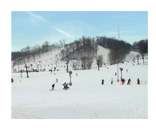
Perfect North Slopes