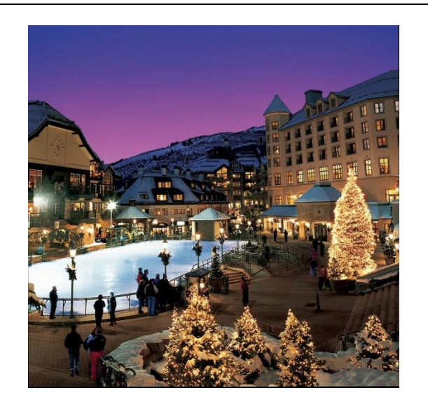
BANFF, CANADA FEB 19 TO 26 (IKON PASS)