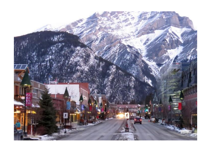
ANDORRA & BARCELONA MARCH 4 -12, 2022