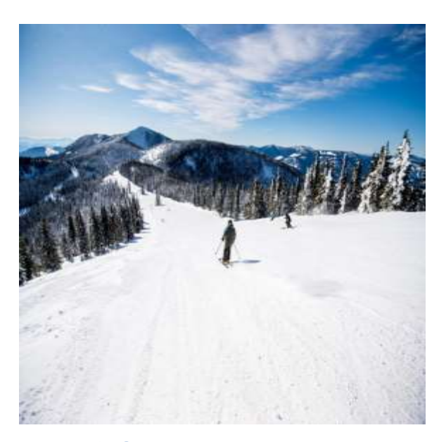
RED MOUNTAIN, BC