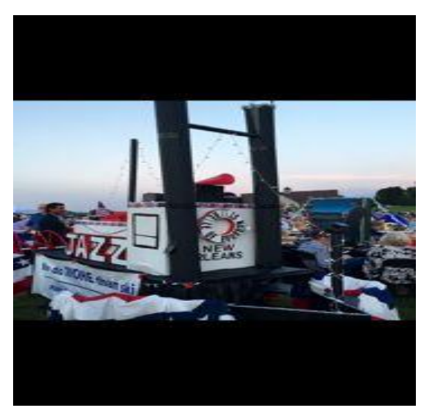
2015 LSSC Table Decoration

In the past, the LSSC has placed and won prizes in the contest.