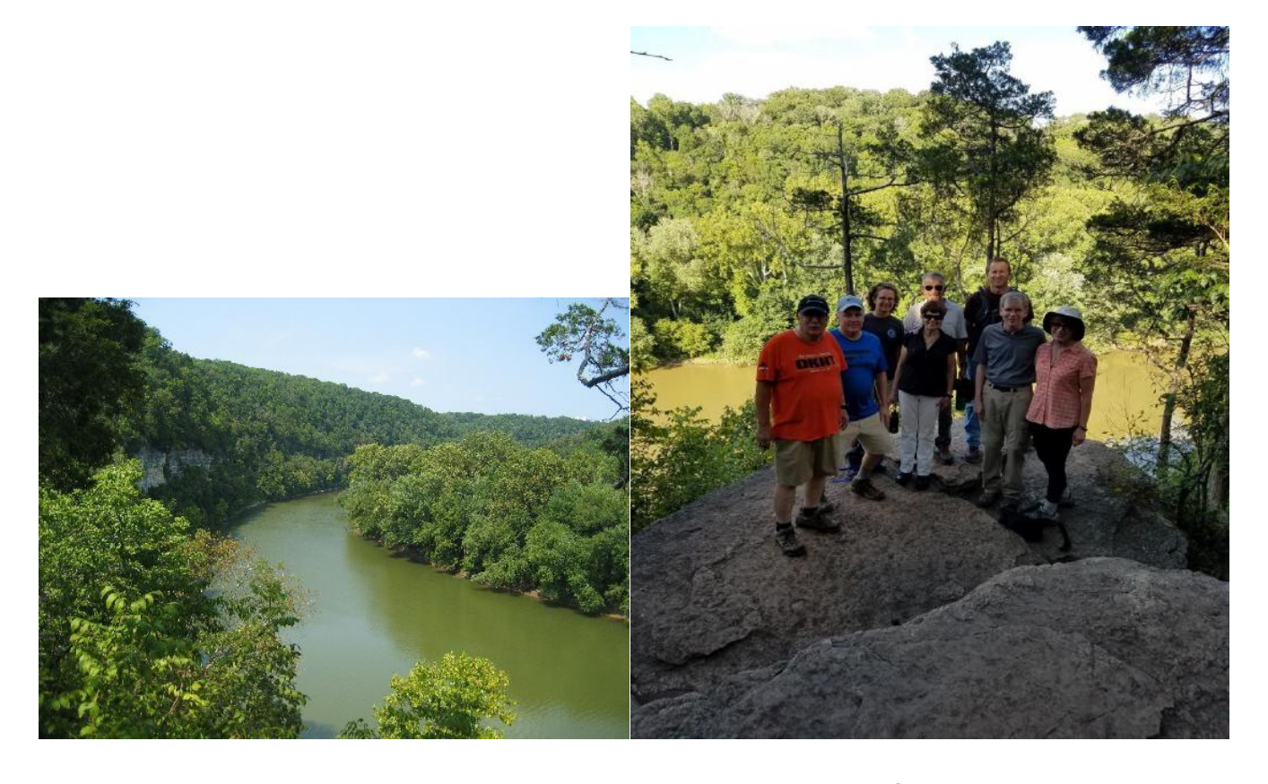
Raven Run Nature Sanctuary Hike